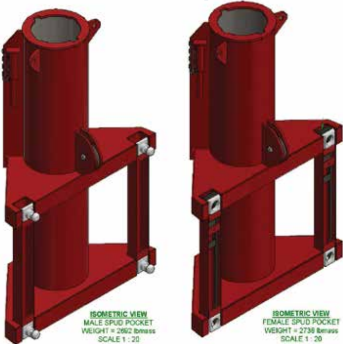
ISOMETRIC VIEW MALE SPUD POCKET WEIGHT = 2692 lbmass SCALE 1 : 20